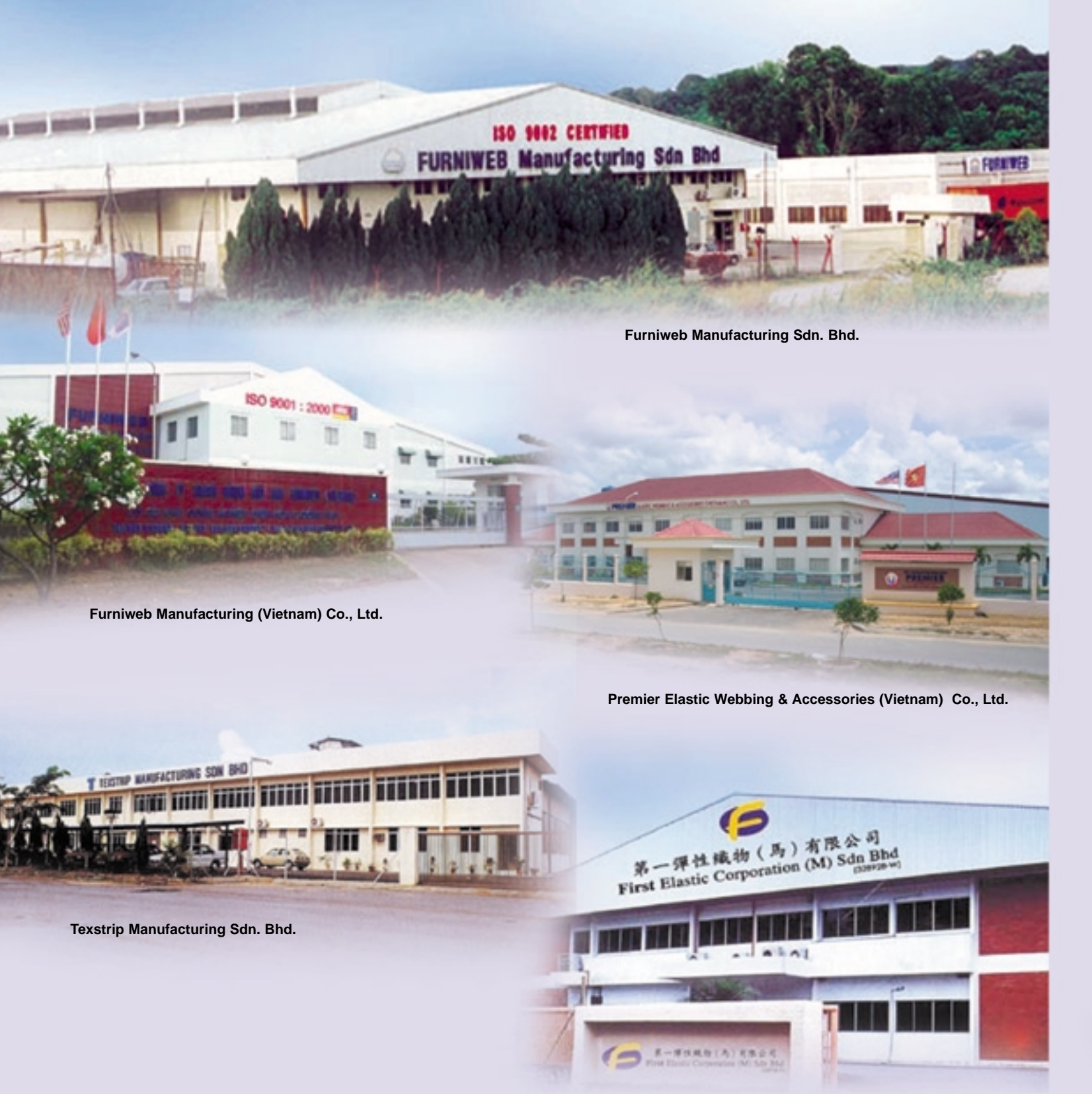
First Elastic Corporation (M) Sdn. Bhd.